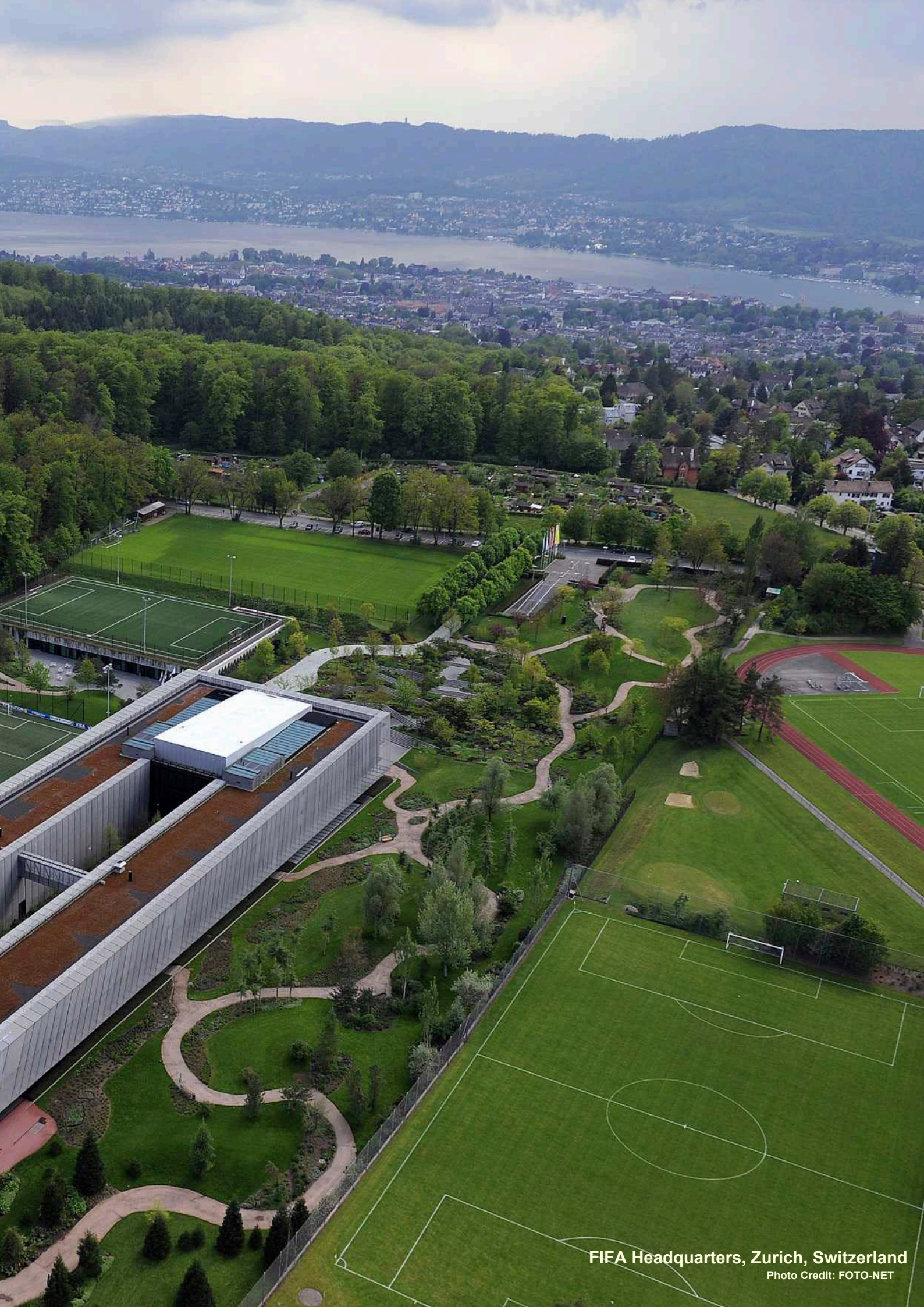
FIFA Headquarters, Zurich, Switzerland